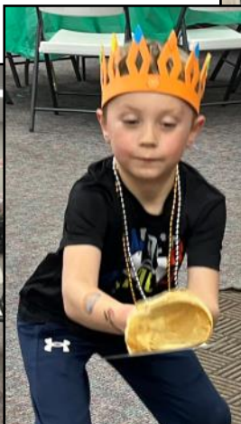
Fun fellowship with crafts, games, and lots and lots of pancakes.